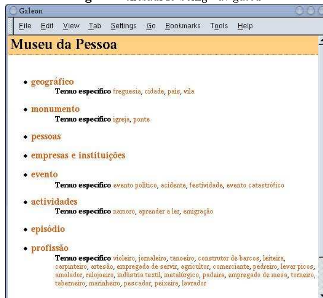
Fig. 1. A thesaurus being navigated