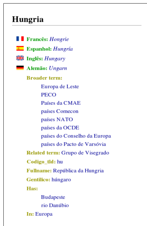
Figure 3: Ontology HTML view

In our experiments, the use of a few word lists, thesauri and multilingual terminologies resulted in a dictionary with about 100 000 entries. The tool also creates the 100 000